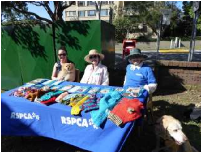
Our regular RSPCA ladies from the NSW Auxiliary, displaying their wonderful hand-knitted doggie wares