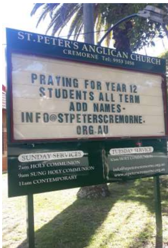
Winnie Street signage