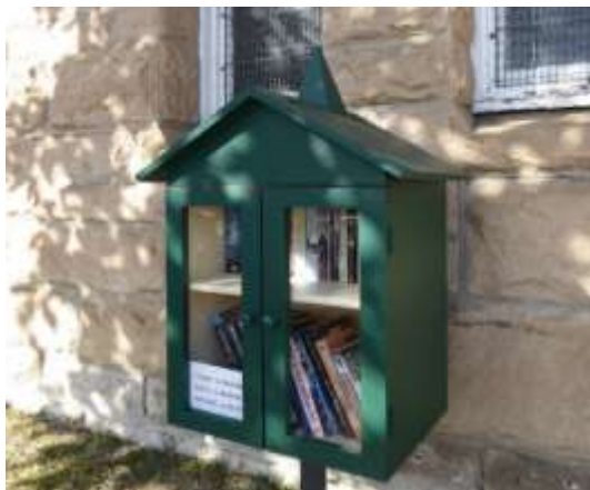
Notice the steeple