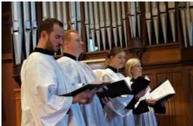
The St Peter's Singers