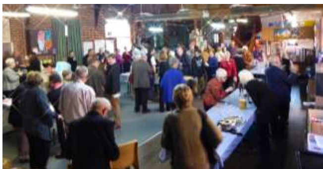
The very popular high tea