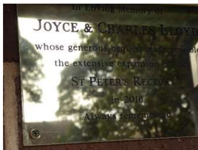
The new plaque on the rectory external wall acknowledging the Joyce Lloyd bequest.