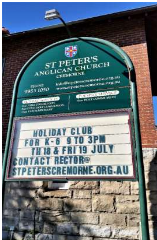
New signage on Waters Road

The notice boards on Waters Rd and Winnie Street were refreshed with up to date information about service times and contact information.