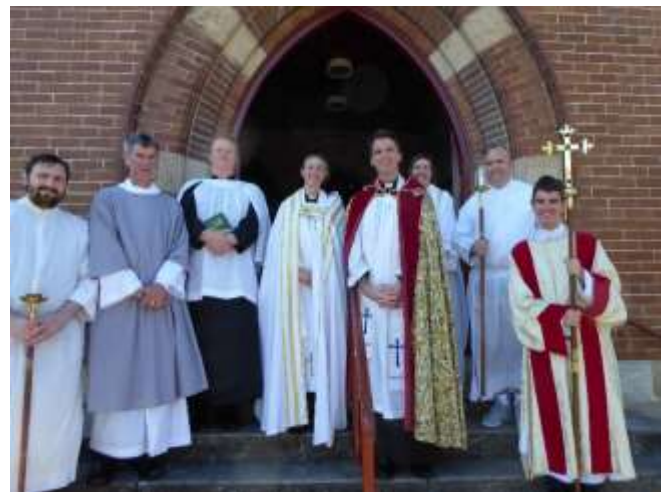
The happy team